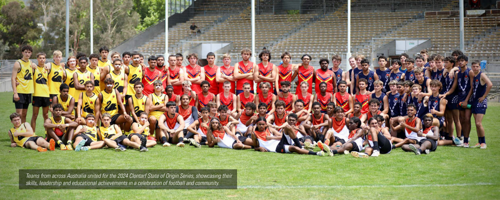
Teams from across Australia united for the 2024 Clontarf State of Origin Series, showcasing their skills, leadership and educational achievements in a celebration of football and community.