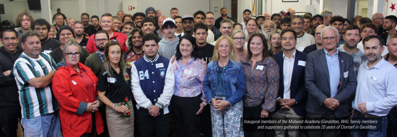
Inaugural members of the Midwest Academy (Geraldton, WA), family members and supporters gathered to celebrate 20 years of Clontarf in Geraldton.