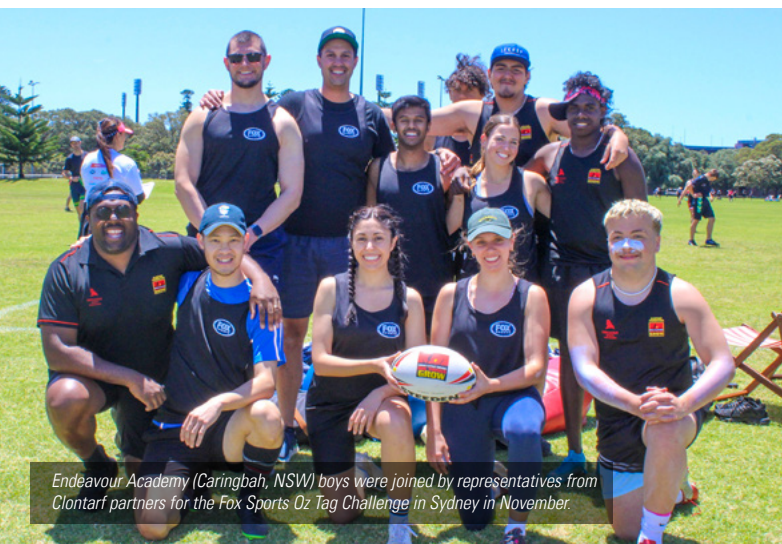
Endeavour Academy (Caringbah, NSW) boys were joined by representatives from Clontarf partners for the Fox Sports Oz Tag Challenge in Sydney in November.