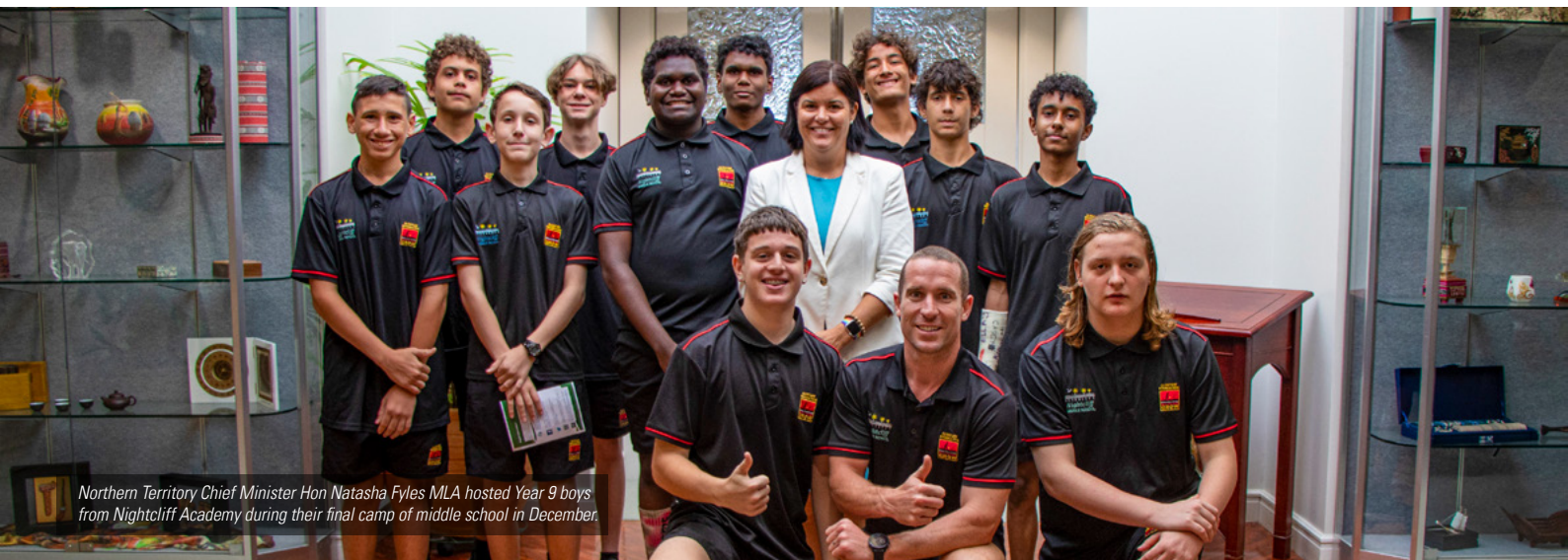
Northern Territory Chief Minister Hon Natasha Fyles MLA hosted Year 9 boys from Nightcliff Academy during their final camp of middle school in December.