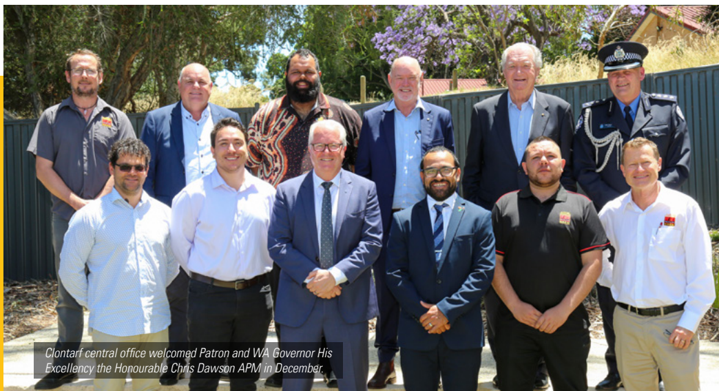
Clontarf central office welcomed Patron and WA Governor His Excellency the Honourable Chris Dawson APM in December.

Through a diverse mix of activities, the full-time, local Clontarf staff mentor and counsel students while the school caters for the educational needs of each student.